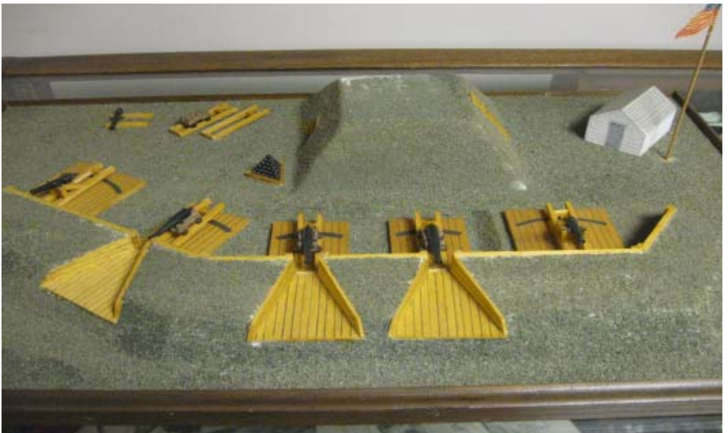
This model of the Jameson Point gun battery (circa 1863) is on display at the Rockland Historical Society.